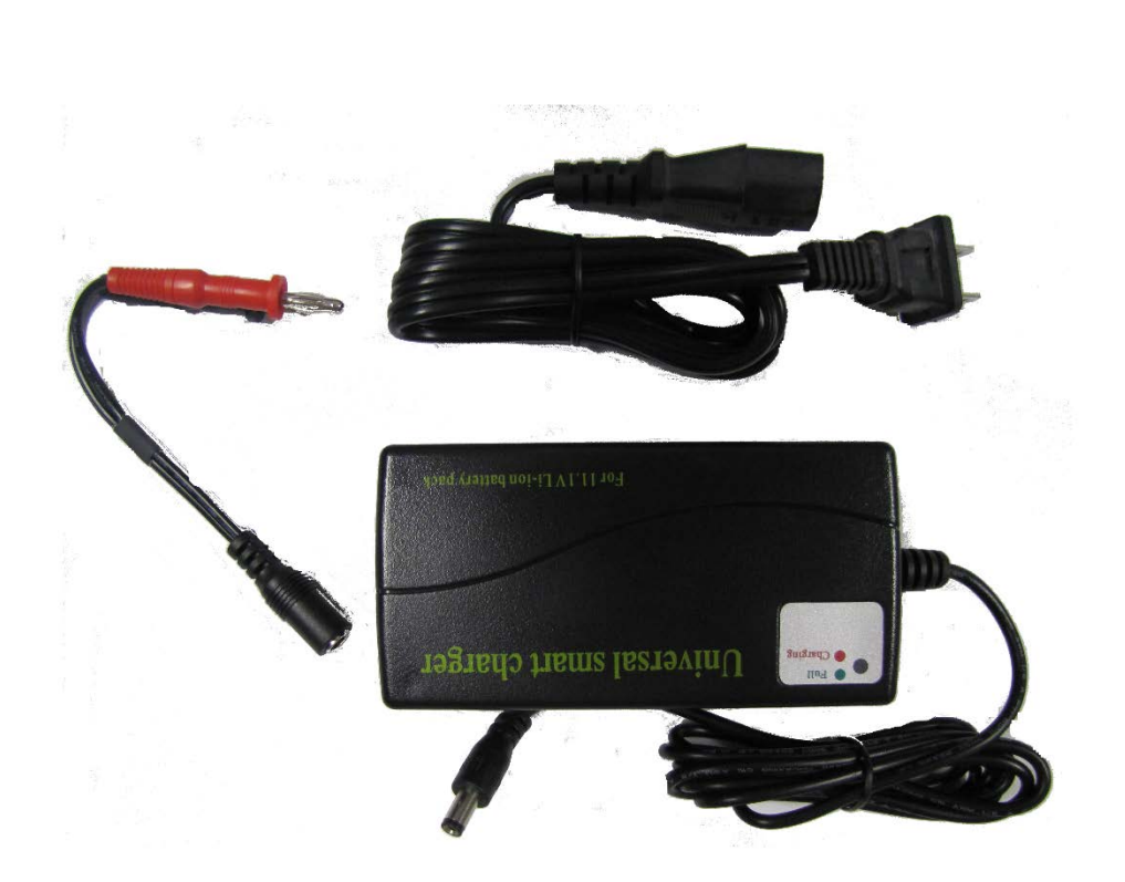
Universal Smart Charger guide is inside the charger box for specifications and care.