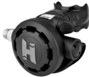
Image 6. Second stage Aura