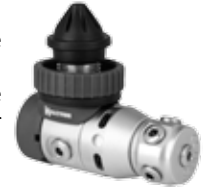
Image 3. Protective cap on DIN inlet

Close the cylinder valve and drain the regulator system by pushing on the purge button of each second stage. After the system has been depressurized, disconnect the first stage regulator from the valve. All first stage inlets must be closed with the provided protective caps to avoid the entry of debris, dirt, or moisture (see Image 3).