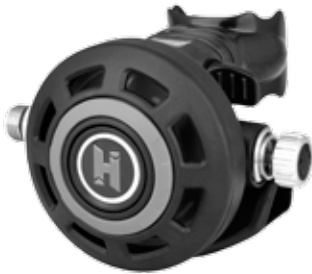
Image 5. Second stage Halo

The Air Control Vane (A.C.V.) directs high-speed air flow over a special vane that creates an area of low pressure inside the second stage housing. This depression pulls the diaphragm inside the housing, maintaining pressure on the valve lever and keeping the valve open without requiring additional effort on the part of the diver. On some Halcyon second stages, the A.C.V. can be adjusted during the dive by changing the position of the flow vane via the knob positioned on the outside of the second stage. On Halcyon second stages not equipped with an external knob, the A.C.V. position is preset to provide high performance while resisting free-flow. This vane can be adjusted by any Halcyon Authorized service technician.