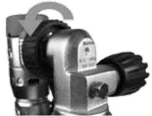
Image 2. DIN connection to cylinder.