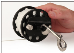
Halcyon Defender Pro™ with EasyGrip™ adaptor

The Defender Pro™ spools are typically purchased with the EasyGrip™ adaptor. This adaptor accommodates the included double-end clip, providing a sturdy and convenient handle. The EasyGrip™ adaptor can be fixed so that it will not turn or be allowed to spin freely. You should experiment to decide the best method of operation depending upon the way you will use your Defender Pro™. For example, you might allow the spool to spin freely while deploying an SMB and lock the EasyGrip™ adaptor while holding your position or winding line on the Defender Pro™ spool.