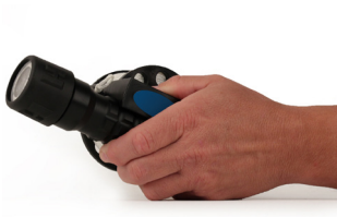
Curved to fit a Scout™ light