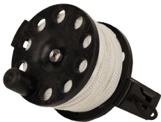
Defender Pro™ 200

The Halcyon Defender Pro™ utilizes a unique, solid center that is designed to accommodate a fully operational spindle, converting the Defender Pro™ from a simple spool to a unique hybrid design. This new design utilizes Halcyon's innovative EasyGrip™ adaptor, converting your double-end clip into a solid handle. The EasyGrip™ adaptor can be locked in place or released to provide full reel-like functionality. Meanwhile, the Defender Pro™ 200 also includes a full-featured Pathfinder™-style handle, allowing three modes of operation (spool, reel, and hybrid).