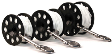
Defender Pro™ spool series

The new Halcyon Defender Pro™ series of guideline devices expands upon the time-tested utility of Halcyon Defender™ spools and the proven functionality of Halcyon Pathfinder™ reels by providing enhanced flexibility and unique operational advantages.