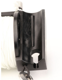
Raised retainer prevents slipping