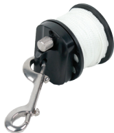
Defender Pro™ 150 reel with EasyGrip™ adaptor