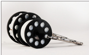
The 200 is only slightly larger than the 150.