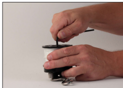
Removal/replacement of the EasyGrip™ adaptor