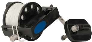
Defender Pro™ 200