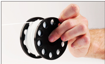
The 200 is easily used as a bare spool.