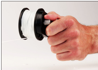
EasyGrip™ in action

Halcyon's innovative EasyGrip™ adaptor is ideal for situations in which divers need a better grip on their spool. For example, divers deploying an SMB might like a better grip; divers using gloves might also struggle to keep their fingers out of the way while winding a classic Defender™ spool. The EasyGrip™ adaptor is also convenient for use when unwinding line, such as while deploying an SMB or while running a longer jump in a cave-diving situation. Divers should practice the use of the EasyGrip™ lock-down screw as they may wish to allow the spool to spin freely in some situations and to prevent its movement in other scenarios.