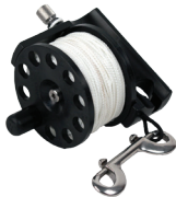
Defender Pro™ 200 reel