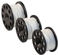
Defender Pro™ family

The Halcyon Defender Pro™ is available in 100-, 150-, and 200-ft sizes (30m, 45m, 60m). Each of these sizes may be used with the universal EasyGrip™ adaptor. When using the 200ft (60m) design with the EasyGrip™ adaptor, you must adjust the lock-screw position to match the holes in the Defender Pro™ spool. The 200ft (60m) Defender Pro™ can be used with a Pathfinder™-style handle or the EasyGrip™ adaptor; it may also be used without any fixtures like a conventional Defender™ spool.