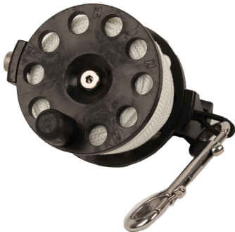
Defender Pro™ 200

The Halcyon Defender Pro™ 200 is a unique guideline device combining the powerful utility of the Halcyon Pathfinder™ reel with the elegant simplicity of the Halcyon Defender™ spool. The Defender Pro™ 200 can rapidly be converted from a Pathfinder™-style reel to a Defender™-style spool, including all the benefits of the revolutionary Defender Pro™ EasyGrip™ adaptor.